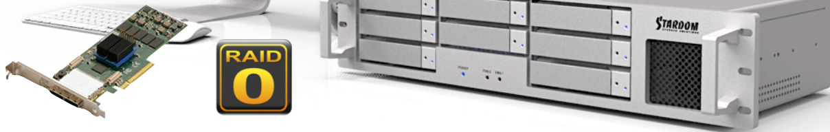
ATTO R680 SAS RAID Card

Use with a RAID controller card and take advantage of the high transmission rate of RAID 0 for high-definition video editing. Video formats like HD/2K can also be easily edited without having to spend time waiting.