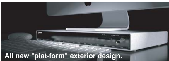
All new "plat-form" exterior design.

With an exterior design that directly focuses on the better usage of your workspace, the new DECK Series unites storage & computer system to keep your creative environment clean and simple. With its top surface capable of withstanding up to 15 kgs. of weight, placing a display monitor or iMac would be the perfect creative ensemble. Or simply stack multiple DECKs together for an even greater amount of storage space.